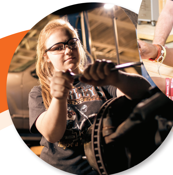
Pictured above (top to bottom) are students enrolled in welding, building trades, and automotive pathways.