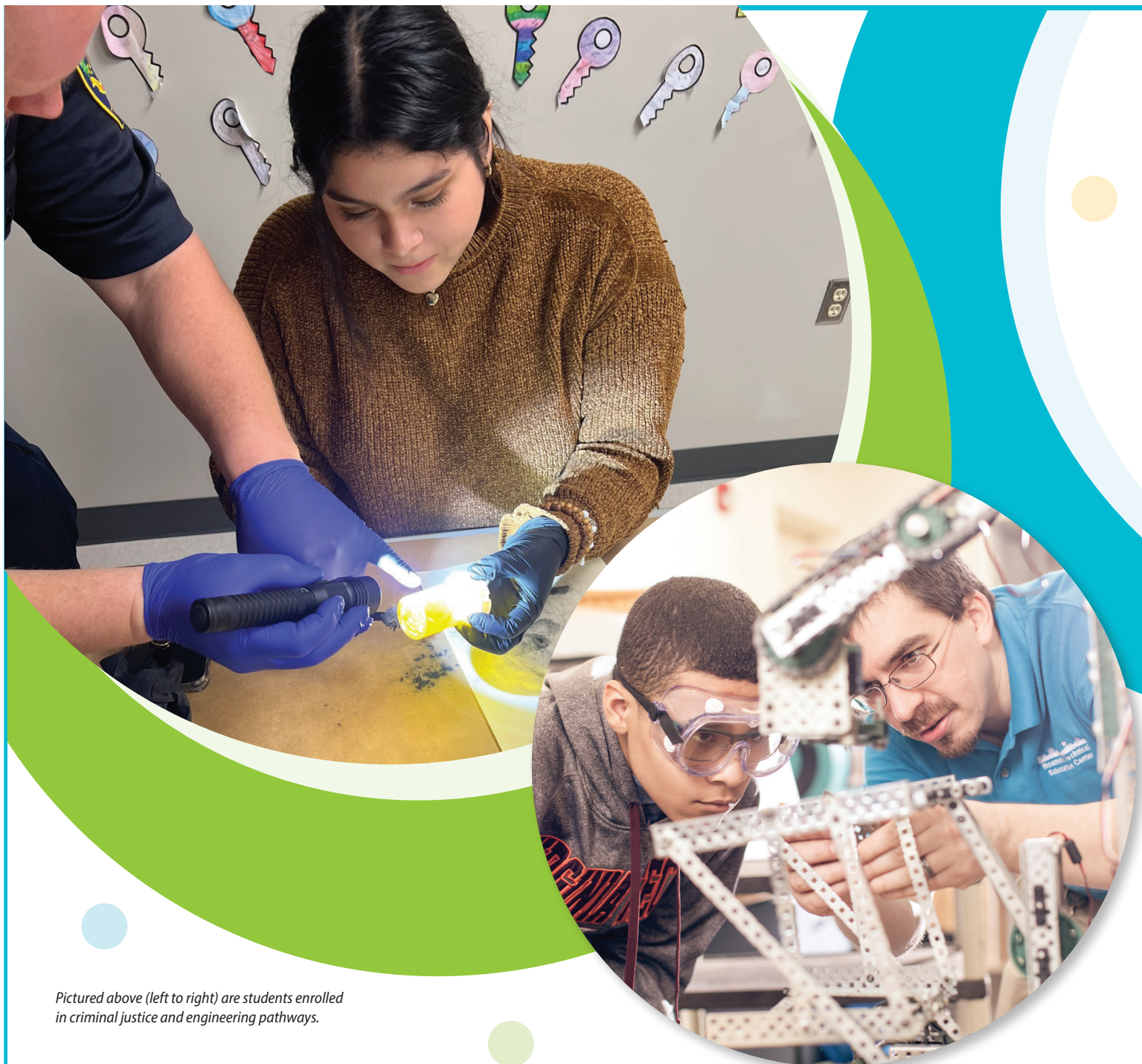
Pictured above (left to right) are students enrolled in criminal justice and engineering pathways.